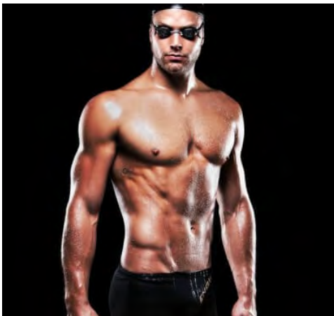
ANDREW LAUTERSTEIN OLYMPIC SWIMMER